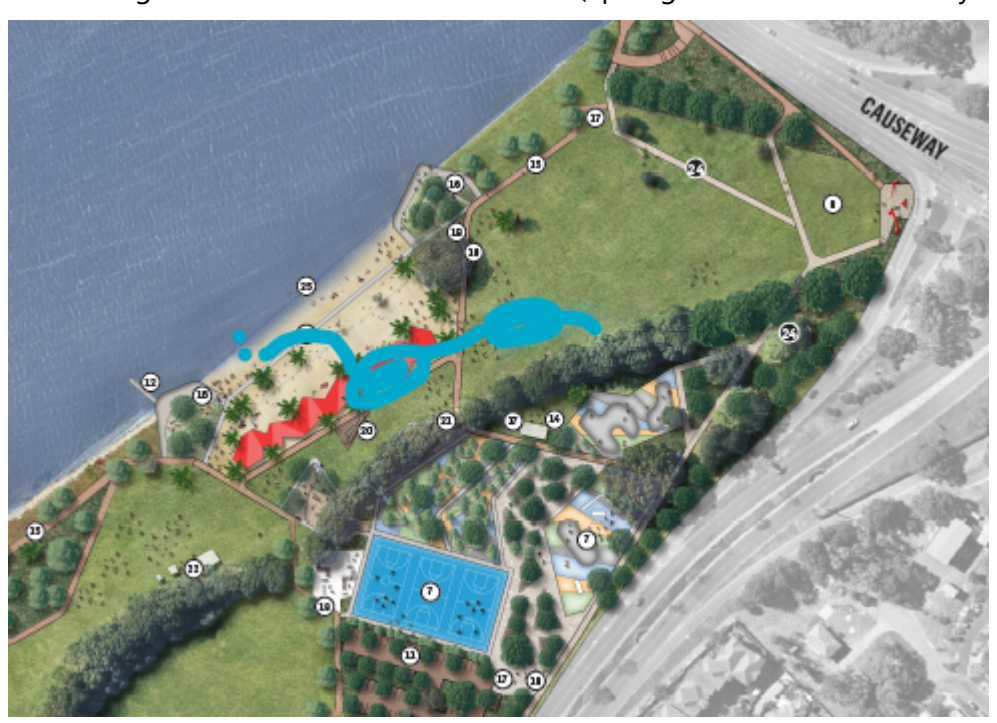
7. Include details on the potential use of zero carbon concrete with a view to the sustainability and recycled content policies of the Town.

The proposed approach would likely bring the Spring daylighting from the existing junction pit on the river side of the ficus trees, and then traverse in a westerly direction through a series of reed lined basins to remove nutrients which could then be clay lined to provide visibility of the spring. The proposed Concept Design will undertake the due diligence on this, carry out the necessary consultation but will examine opportunities for the creation of natural habitat, natureplay, and a more sympathetic connection to the river through a tidal inlet and natural beach (apologies for the rudimentary illustration).